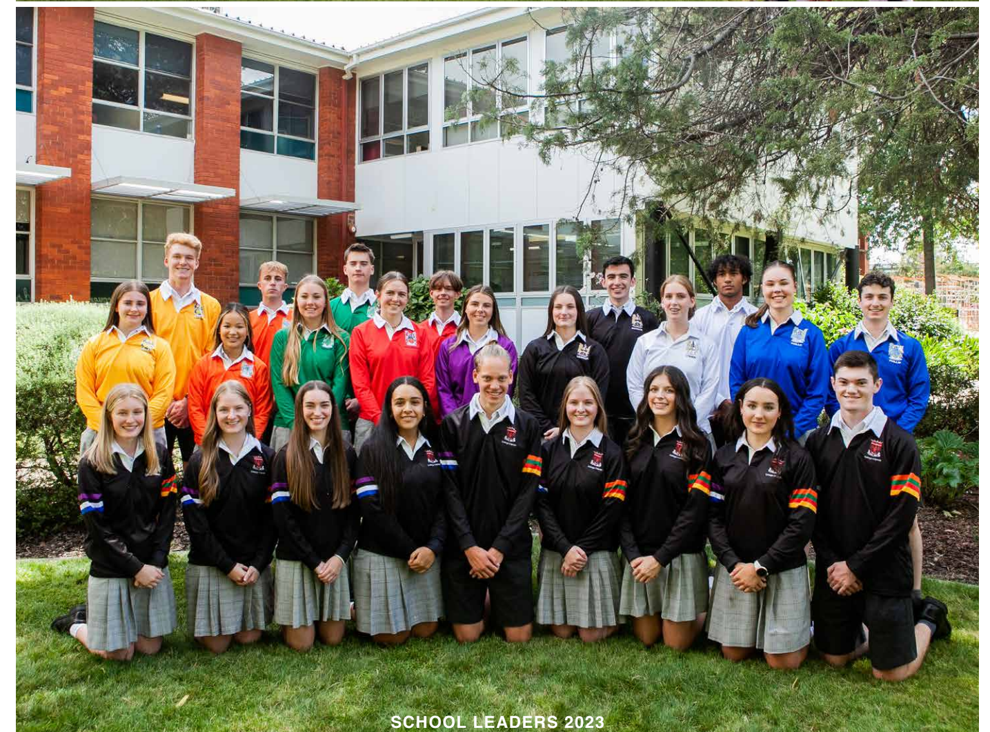
SCHOOL LEADERS 2023