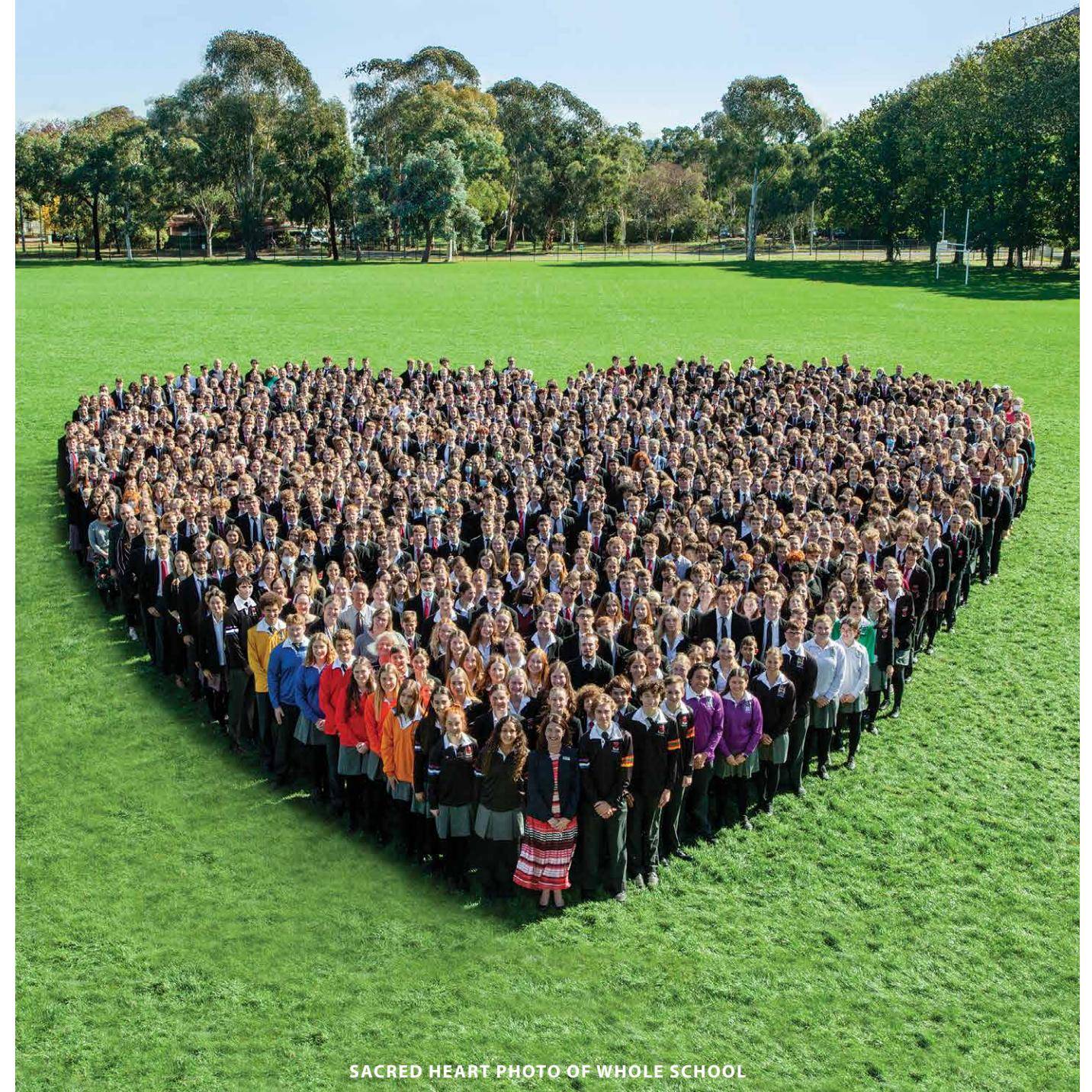
SACRED HEART PHOTO OF WHOLE SCHOOL