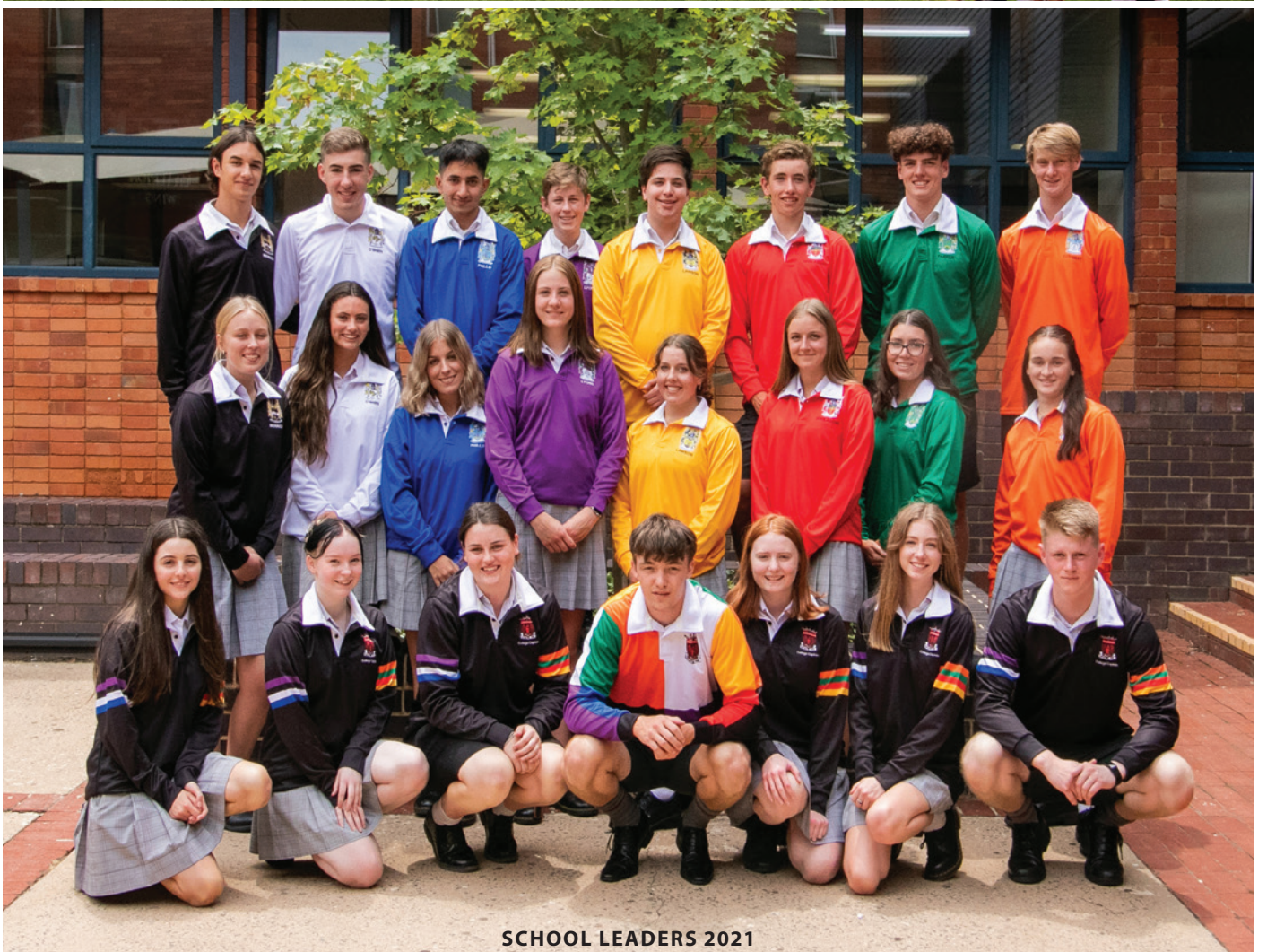
SCHOOL LEADERS 2021