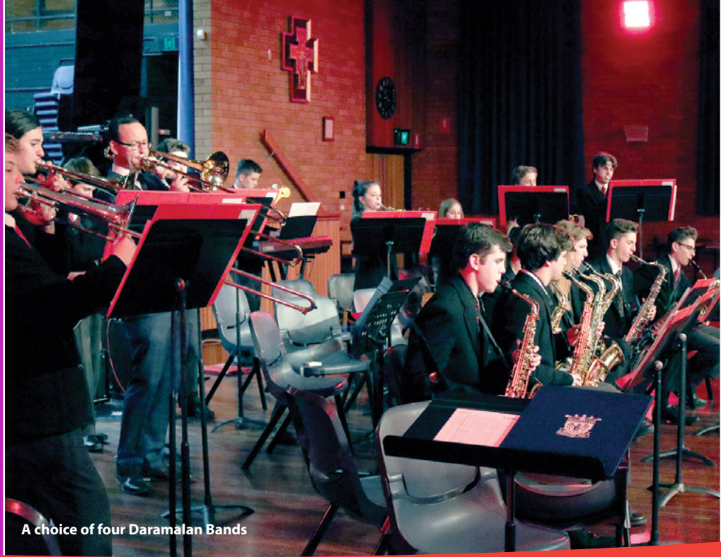
A choice of four Daramalan Bands

Daramalan is committed to educating students from Year 7 to Year 12 with values that reflect the ethos of the Missionaries of the Sacred Heart