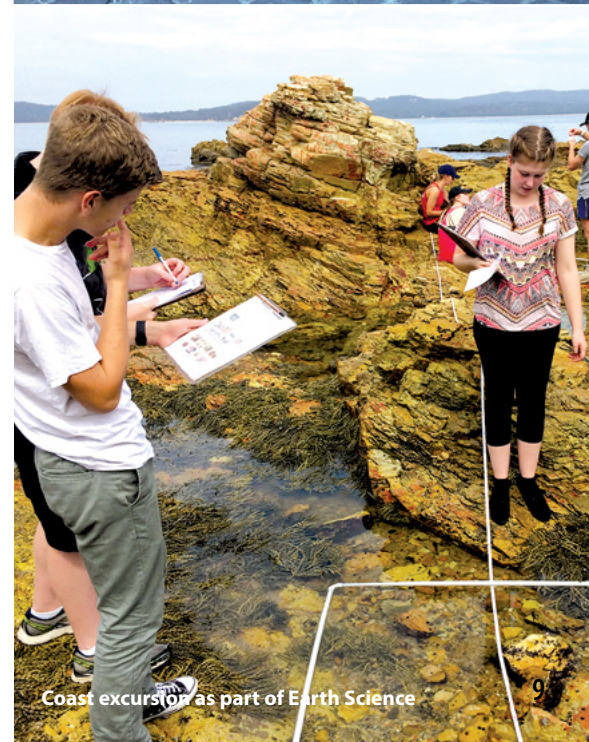
Coast excursion as part of Earth Science