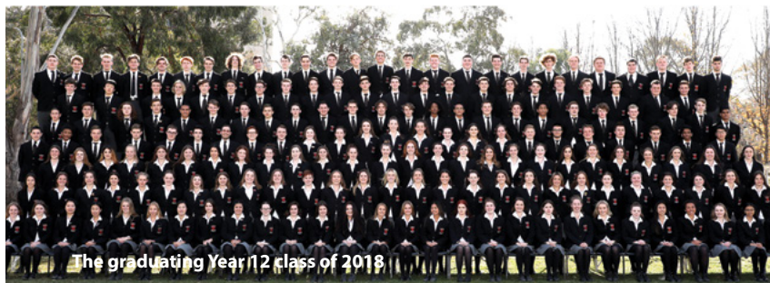
The graduating Year 12 class of 2018

Students who demonstrate the required competencies in Vocational courses will receive a nationally recognised Vocational Certificate in their course of study.