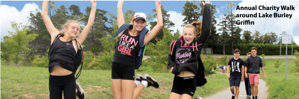
Annual Charity Walk around Lake Burley Griffin