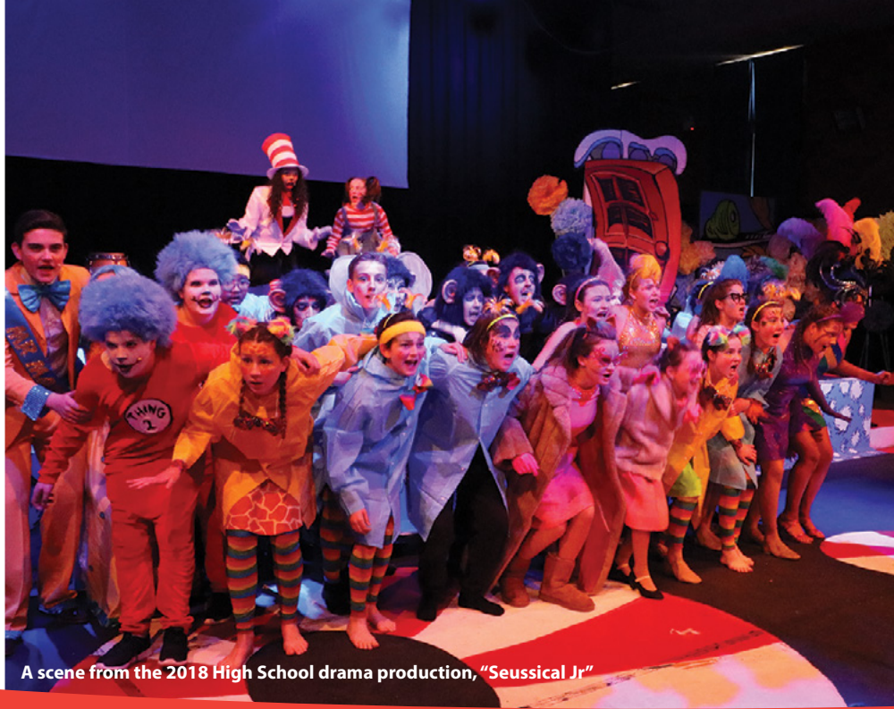
A scene from the 2018 High School drama production, "Seussical Jr"