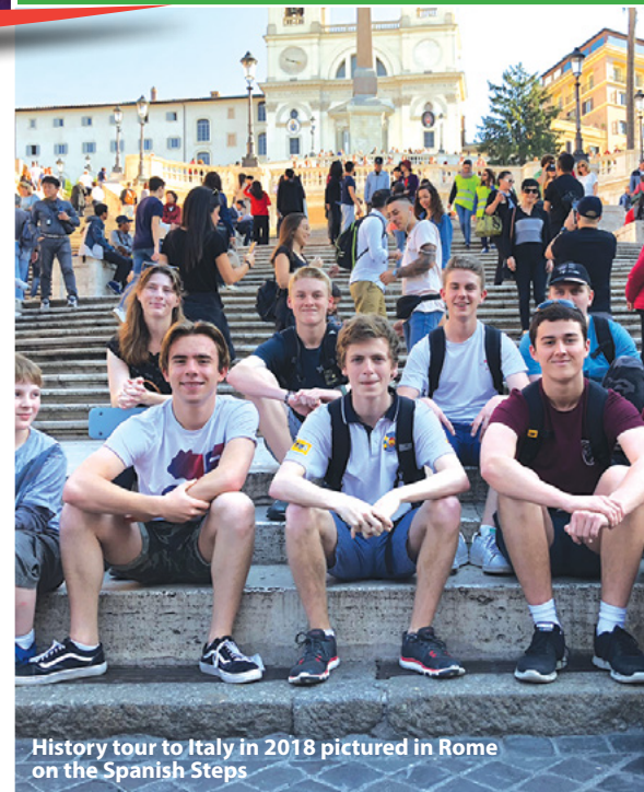
History tour to Italy in 2018 pictured in Rome on the Spanish Steps