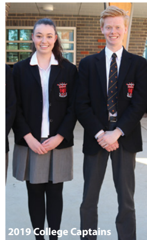
2019 College Captains

Student leaders provide strong and positive role models, act reliably with initiative and confidence, display commitment and loyalty to the school and the wider community and show maturity in communicating in both student and adult environments.