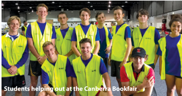
Students helping out at the Canberra Bookfair