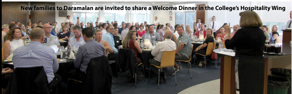
New families to Daramalan are invited to share a Welcome Dinner in the College's Hospitality Wing