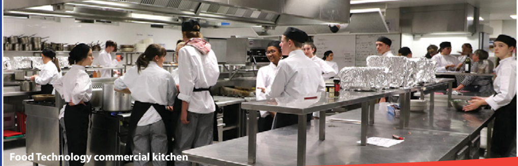
Food Technology commercial kitchen

Daramalan College has fully implemented the Australian Curriculum