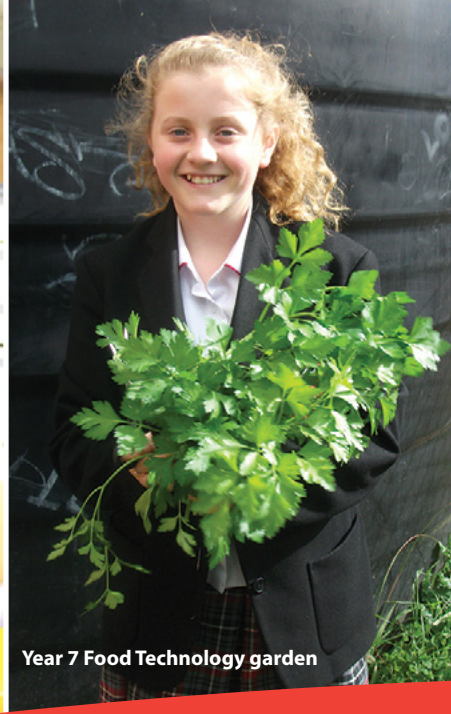
Year 7 Food Technology garden