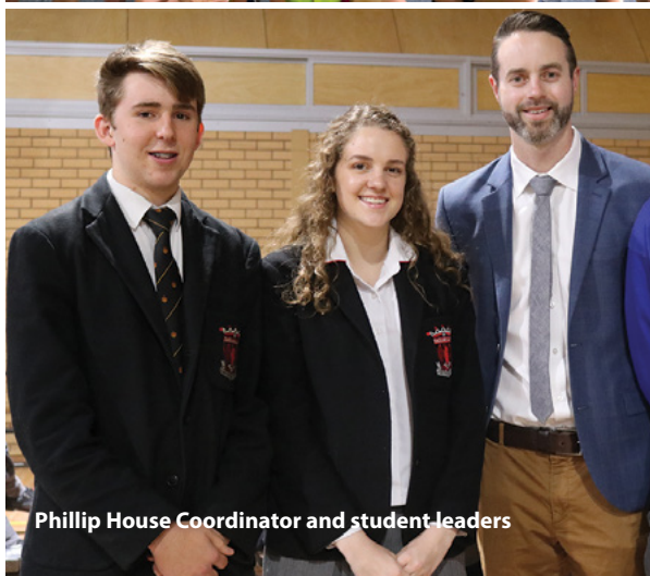
Phillip House Coordinator and student leaders