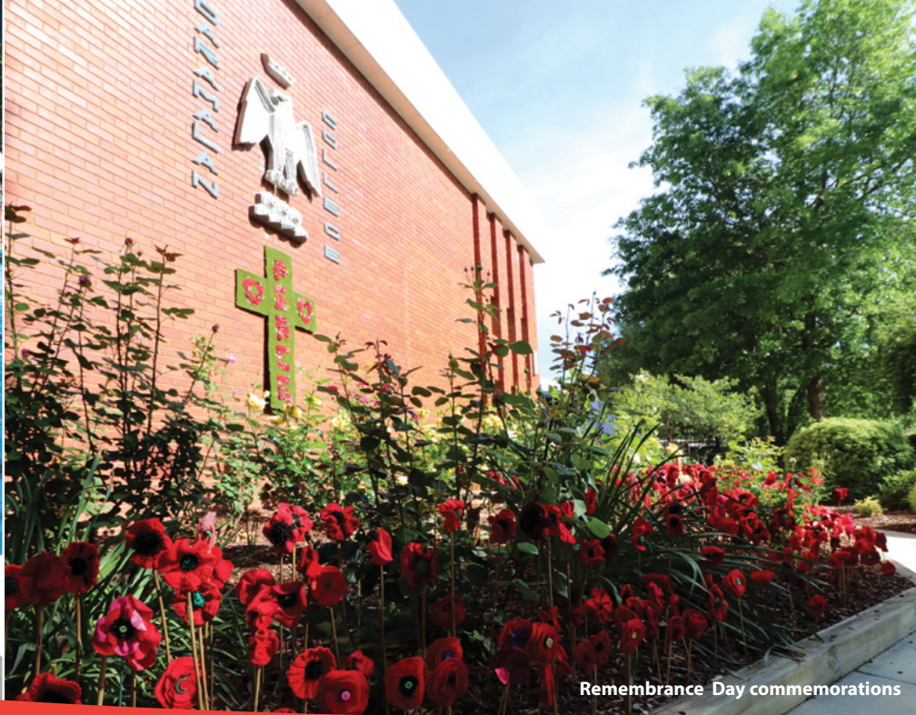
Remembrance Day commemorations