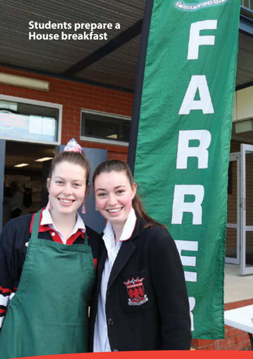
Students prepare a House breakfast